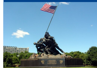
Iwo Jima Monument