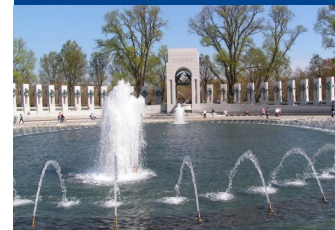
World War II Memorial