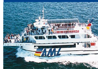
Whale Watching Cruise on Bay St. Catherine.