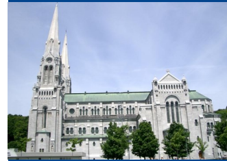
St. Anne De Beaupre Shrine

Departure: Walmart (old), 3021 1st Ave E, Newton, IA @ 8 am