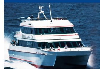
Mackinac Island Ferry

Departure: Walmart (old), 3021 1st Ave E, Newton, IA @ 8 am