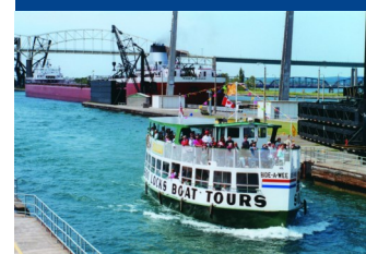
Soo Locks Cruise in Sault Sainte Marie