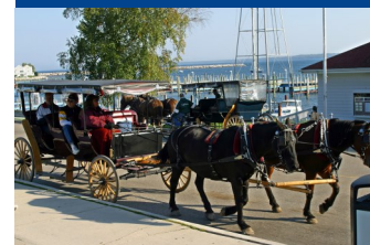
Tour Mackinac Island by Horse and Carriage