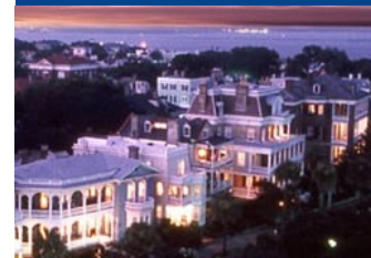
Charming Charleston, SC