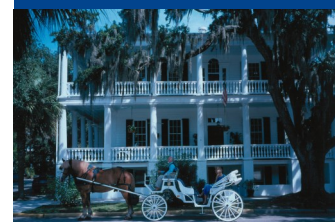
You'll feel like you've traveled back in time!