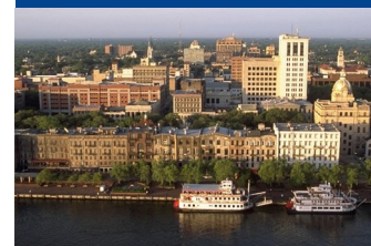
Savannah - the "Belle of Georgia"