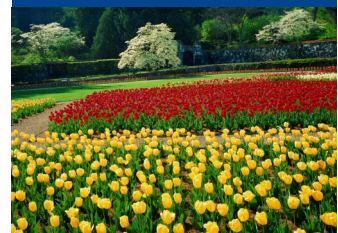
One of the Biltmore's many gardens.