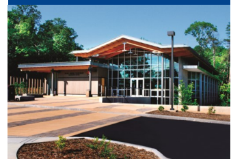
The Blue Ridge Parkway Visitor Center.