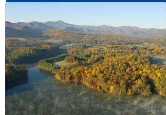
View the Blue Ridge Mountains.

Day 6: Today after enjoying a Continental Breakfast, you depart for home... A perfect time to chat with your friends about all the fun things you've done, the spectacular sights you've seen and where your next group trip will take you!