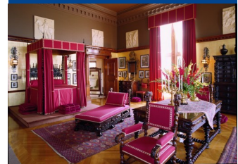
Grand Victorian architecture.