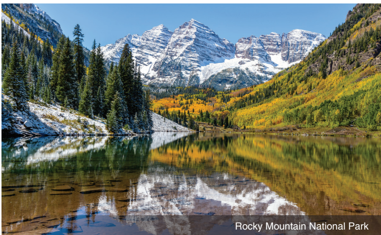
Rocky Mountain National Park

Days 5 and 6 – Hilton Garden Inn, Denver, Colorado