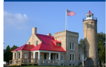
Mackinac Point Lighthouse