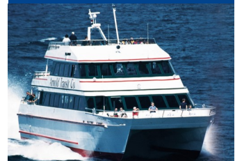
Mackinac Island Ferry