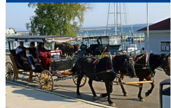
Tour Mackinac Island by Horse and Carriage

Day 7: Today you'll enjoy a Continental Breakfast and depart for home... a perfect time to chat with your friends about all the fun things you've done, the great sights you've seen and where your next group trip will take you!