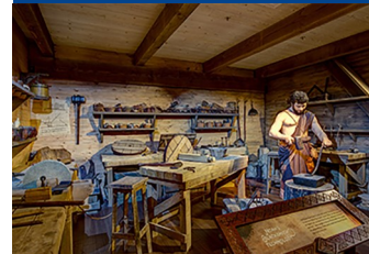
View from Inside the Ark Encounter

$75 Due Upon Signing. *Price per person, based on double occupancy. Add $179 for single occupancy. Final Payment Due: 5/4/2022