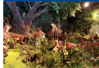
Visit to the Amazing Creation Museum!