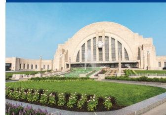
Incredible Cincinnati Museum Center, including an Omnimax Show