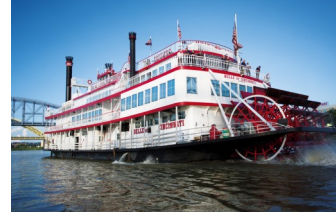
Enjoy a BB Riverboats Sightseeing Cruise