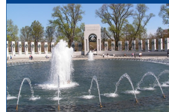
World War II Memorial