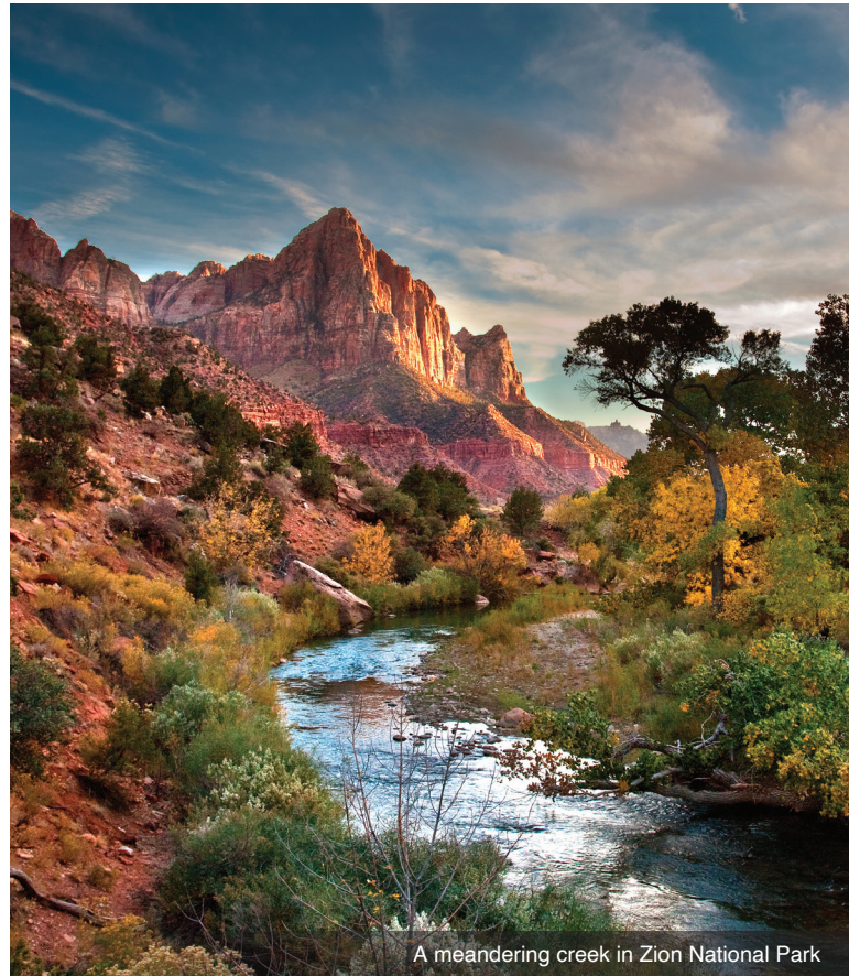
A meandering creek in Zion National Park

DAY 1 Arrive in Utah: Welcome to Salt Lake City, Utah. With flights arriving from across the country, meet your Tour Manager in the hotel lobby at 6:00 p.m. for dining suggestions.