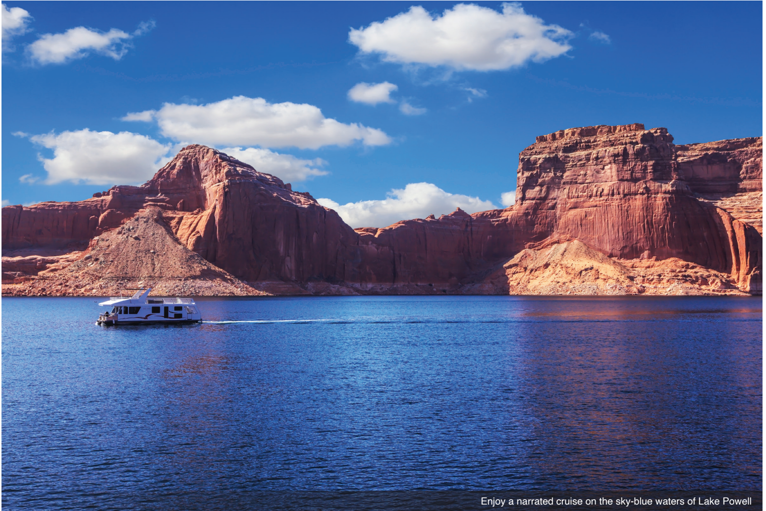
Enjoy a narrated cruise on the sky-blue waters of Lake Powell