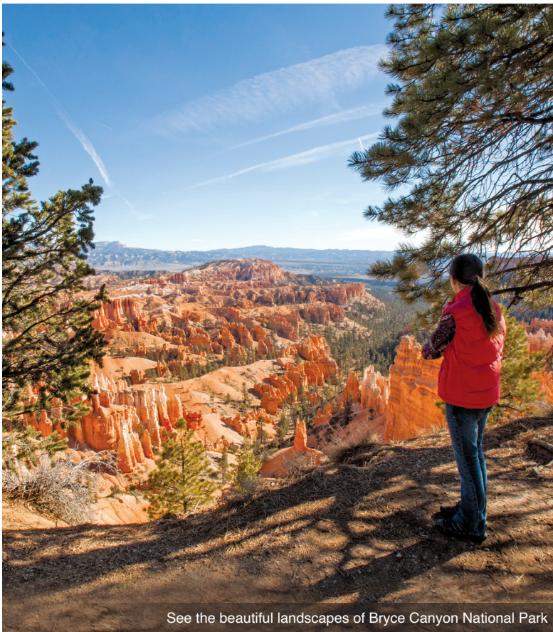
See the beautiful landscapes of Bryce Canyon National Park

Follow the Rim Drive to view the vividly-colored, fantastic rock formations approximating castles, temples and even whole cities sculptured in stone! Called hoodoos, these structures have been formed by frost weathering and stream erosion of the river and lake bed sedimentary rocks. Meals: B, D