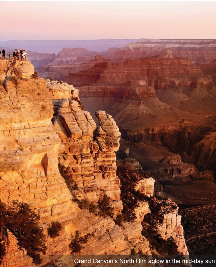
Grand Canyon's North Rim aglow in the mid-day sun