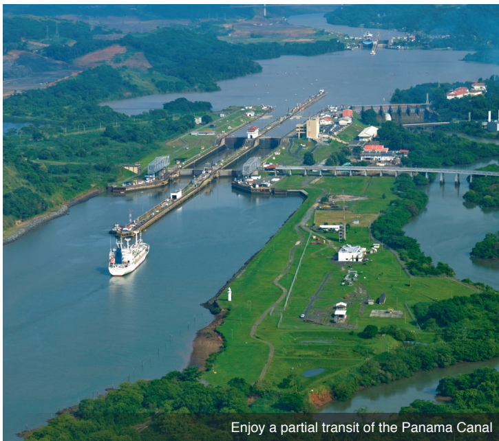
Enjoy a partial transit of the Panama Canal