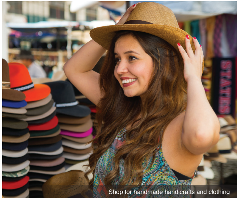
Shop for handmade handicrafts and clothing

DAY 1 USA / Panama City, Panama: Depart the USA on your flight to Panama City. Upon arrival, you'll be met by a Mayflower Cruises & Tours representative and transferred to your hotel. Flights should arrive by 4:00pm. The afternoon is at leisure to become acquainted with your new surroundings. This evening, join your Tour Manager for an orientation meeting at the hotel.