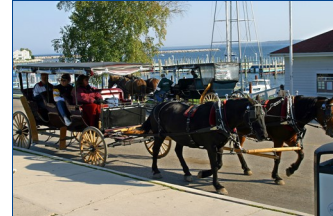
Tour Mackinac Island by Horse and Carriage