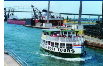
Soo Locks Cruise in Sault Sainte Marie