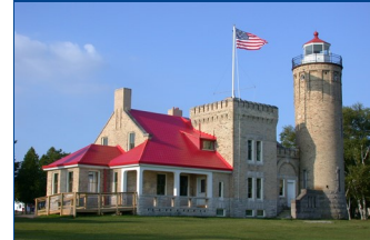
Mackinac Point Lighthouse