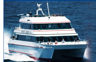
Mackinac Island Ferry

Departure: Taco Johns, 2106 First Ave. East, Newton, IA @ 8 am