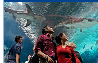
Visit to the Newport Aquarium

Departure: Taco Johns, 2106 First Ave. East, Newton, IA @ 8 am