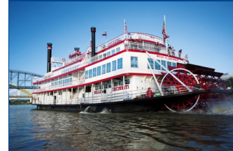
Enjoy a BB Riverboats Sightseeing Cruise