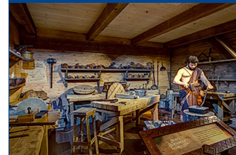
View from Inside the Ark Encounter