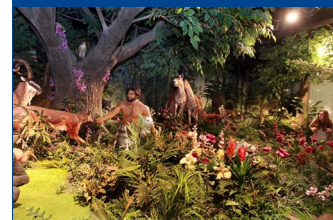
Visit to the Amazing Creation Museum!