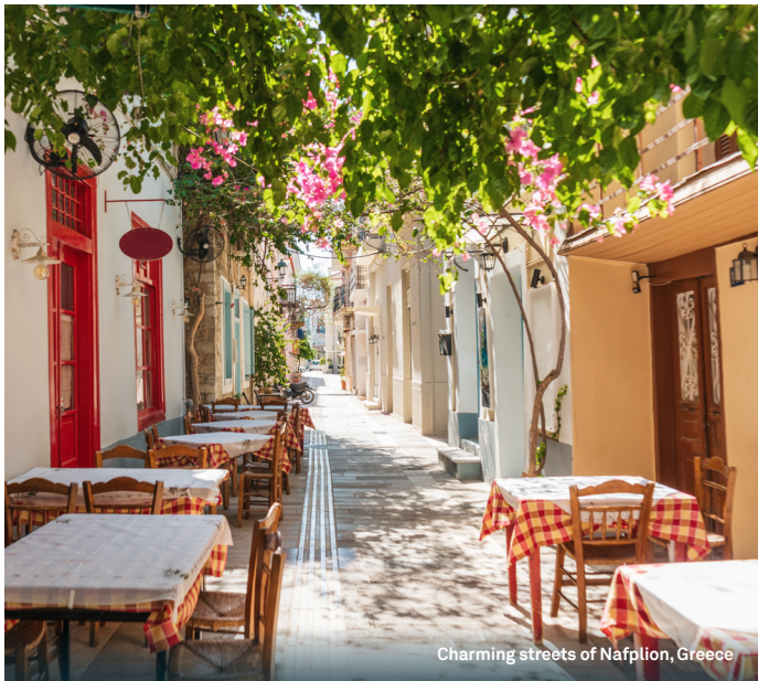
Charming streets of Nafplion, Greece