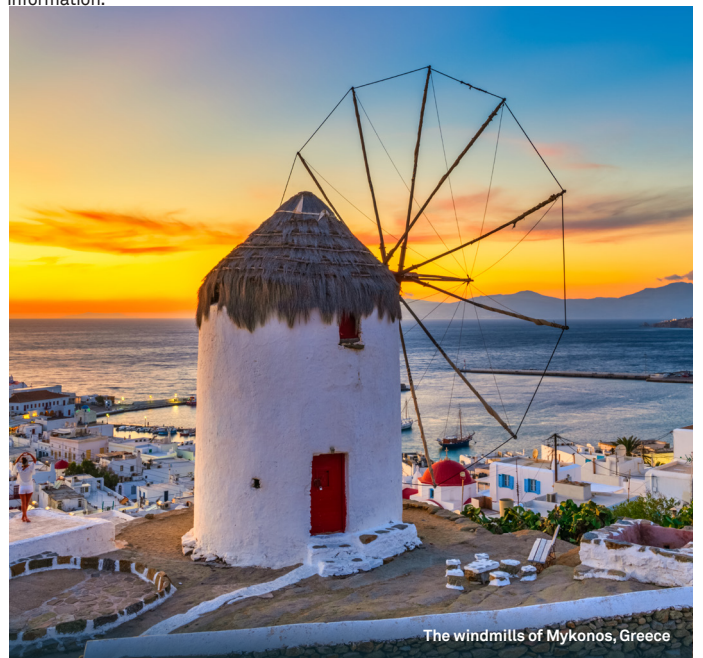
The windmills of Mykonos, Greece