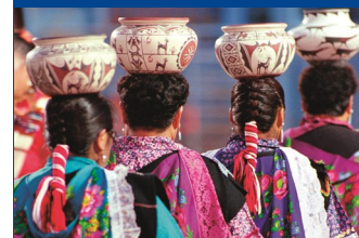
Native Southwestern Culture and Crafts