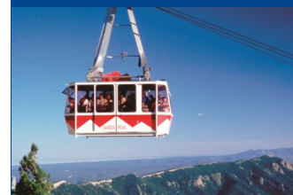
Breathtaking Views of the Sandia Mountains