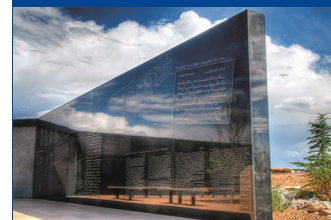
New Mexico Veterans' Memorial